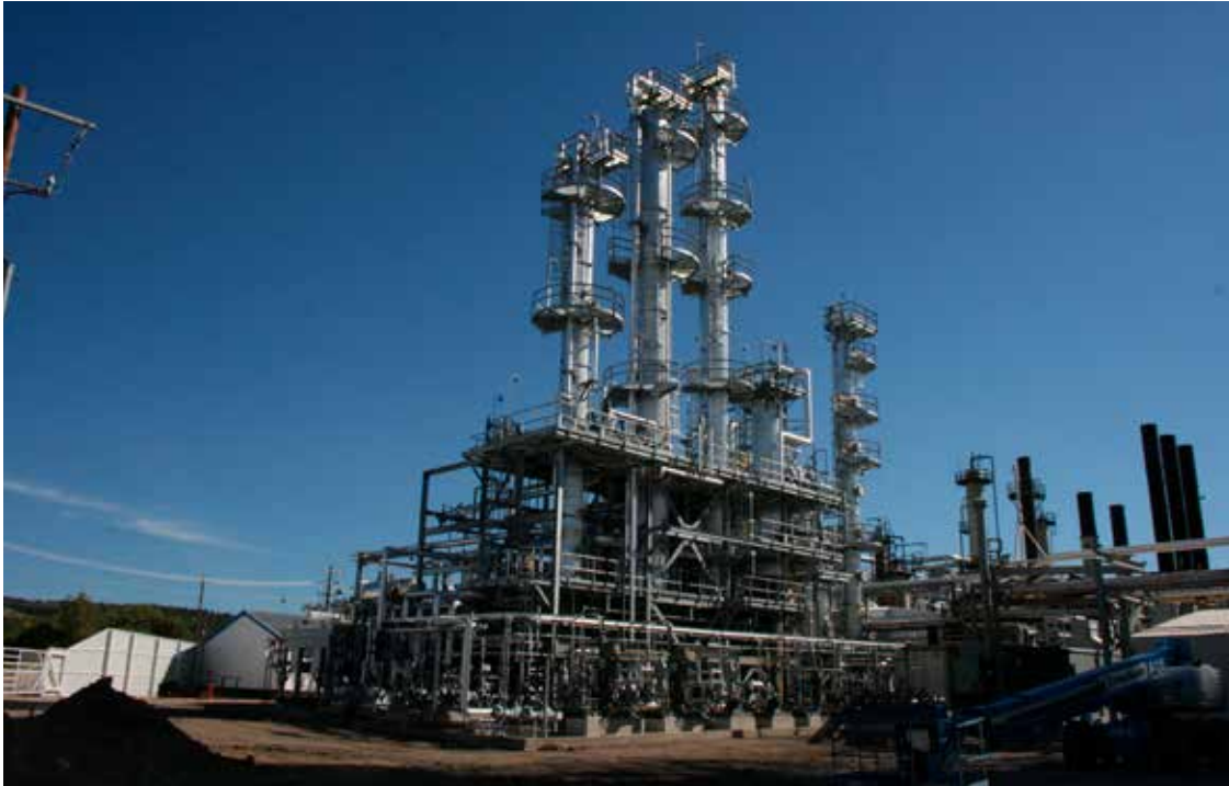
Badger BenzOUT technology at Wyoming Refining Company's (a Par Pacific company) refinery in Newcastle, Wyoming