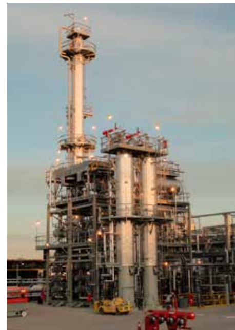
Badger BenzOUT technology at Husky Energy's refinery in Superior, Wisconsin.

Badger BenzOUT technology converts benzene typically in a light reformat stream to higher alkylaromatic components. The technology can use either Fluid Catalytic Cracker (FCC) propylene or ethylene streams, or a mixture of propylene and butenes as the co-feedstock. Badger BenzOUT technology can be installed as a grassroots unit or it can be retrofitted into an existing facility, such as a polygas or saturation unit.